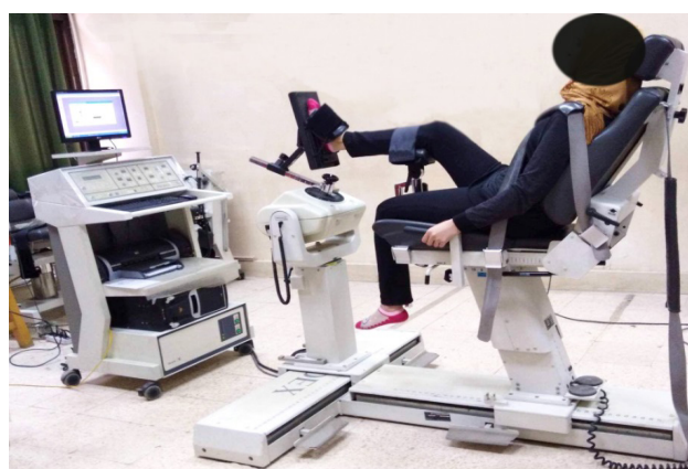
Figure 2. Induction of fatigue to evertor muscles by using the isokinetic machine

To induce fatigue, the participant was instructed to perform repeated eversion contractions above 70% of the predetermined maximum voluntary contraction. This testing protocol had revealed valid results in a previous study [27]. The test was terminated if the participant reached the fa-