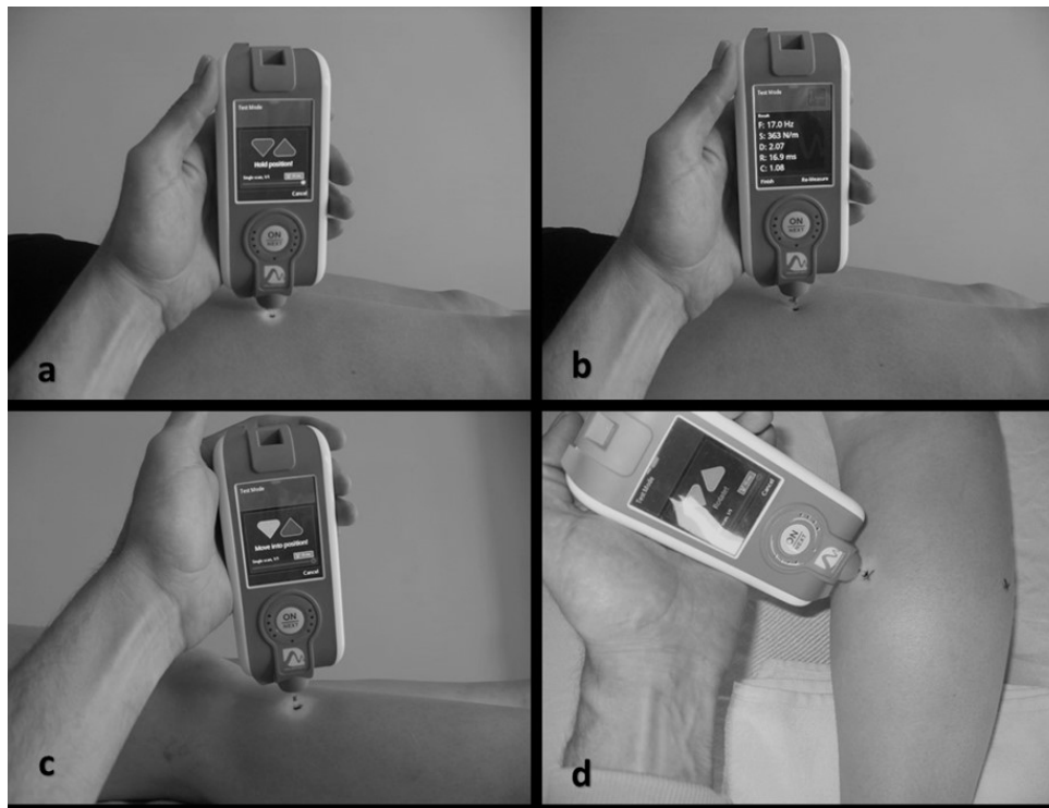
Figure 2. Examples of myotonometric assessment: (a, b) rectus femoris (c) tibialis anterior (d) gastrocnemius lateralis

lations. These stimulations induce damped natural oscillations in the tissue and the device records these oscillations with an accelerometer. Muscle tone, elasticity, and stiffness are calculated separately by the device [30].