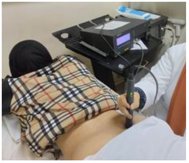
Figure 2. Application of LLLT on sacroiliac joint

Group B received posture correction exercises from any comfortable position. For example, lying in a supine position, they were instructed to draw the chin in, straighten the back of the neck, retract the shoulders, inhale in through costal breathing, contract the abdominal muscles and glutei, push their back against the plinth as they tilt the pelvis posteriorly, press the knees down, and dorsiflex both ankles. This position should be maintained for 10 s, and then the women were asked to relax. The exercises should be repeated 10 times, 3 sets per day, twice weekly for 6 weeks. The women were